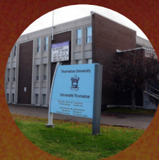
Community Partner Award WOMEN'S, GENDER AND SEXUALITY STUDIES DEPARTMENT

Fierté Sudbury Pride was proud to present the 25th Anniversary 2SLGBTQ+ Community Awards Gala , celebrating 25 years of Pride in Sudbury and recognizing the significant contributions that various 2SLGBTQ+ leaders from across sectors and generations have made to our community. Award recipients included a number of exemplary individuals and community organizations who have done exceptional work within their fields and who are helping to uplift and progress the 2SLGBTQ+ community in Greater Sudbury.